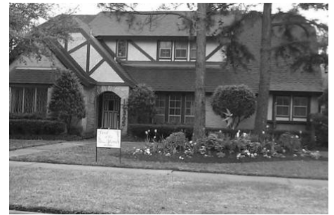
16305 Acapulco Kent & Debbi Bartholomew