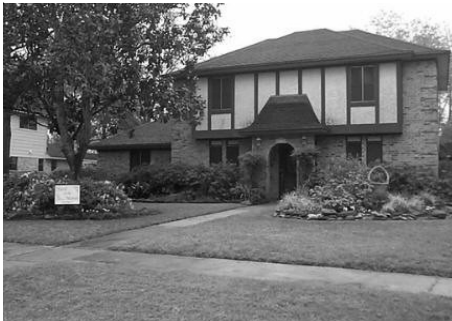
15401 Chichester Dorothy Geveshausen