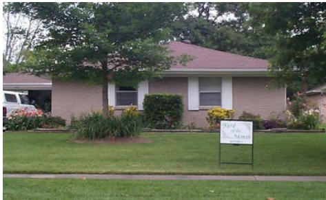
15910 Acapulco Eugene Scroggs