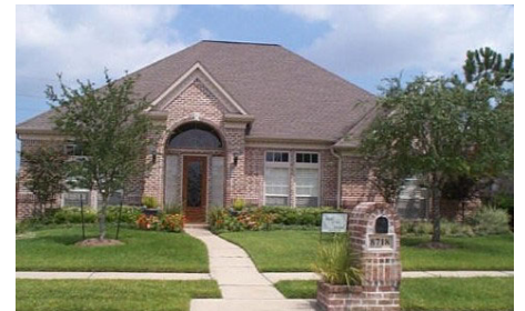
8718 Wyndham Village Ann Buren