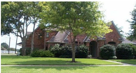
16001 Wall Street Charles & Laurel Calkins