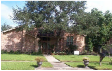
16106 Wall Gladys Sparkman