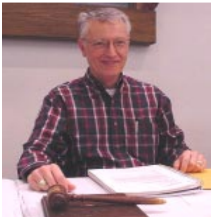
Mayor Ed Heathcott