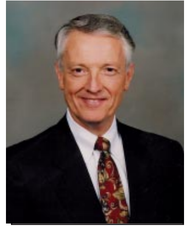
Mayor Ed Heathcott

On Saturday, February 2, 2002, Jersey Village residents will have some critical decisions to make in a very important bond election. There are three specific projects that require your attention and support: