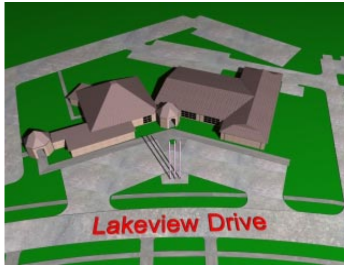
Computer drawing of City Hall ▲ Proposed new Fire Station ▼

Originally the City considered relocating City Hall to Senate Avenue. Then, out of the blue, the Church of Christ property went up for sale. The City bought the property to keep all City operations at one site. The bonus was that