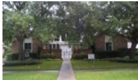
■ 15702 Congo A E Buck