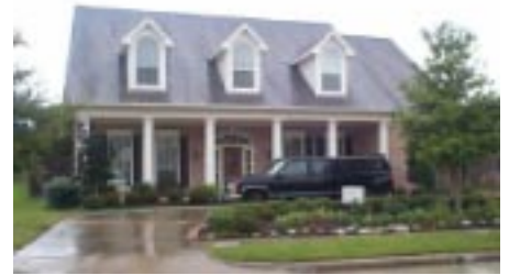
■ 8525 Ivy Falls J R Twachtman